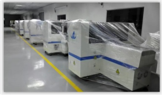
Complete packing, guaranteed with latest product display.