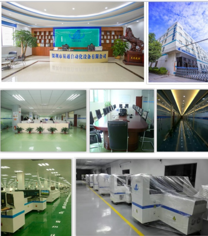
Complete packing, guaranteed with latest product display.