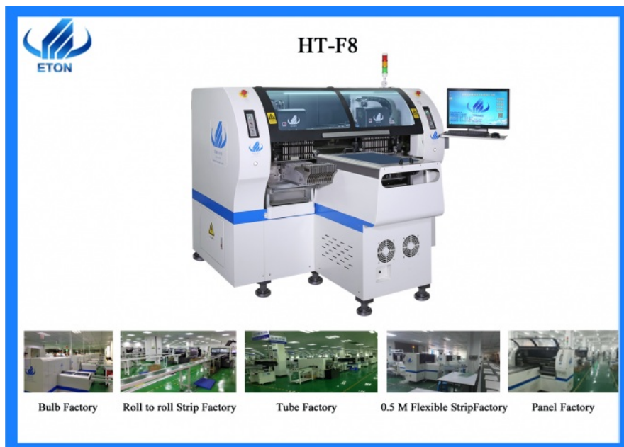
Technical parameter of pick and place machine ht-f8

SMT mounter ht-f8 is especially applies to LED display. Max mounting height is 15mm,mounting speed is 150000CPH.