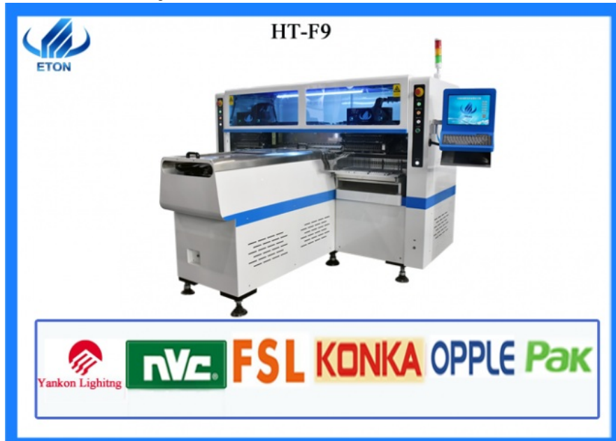
Product parts of high speed mounter ht-f9

Auto-optimization after coordinates generated