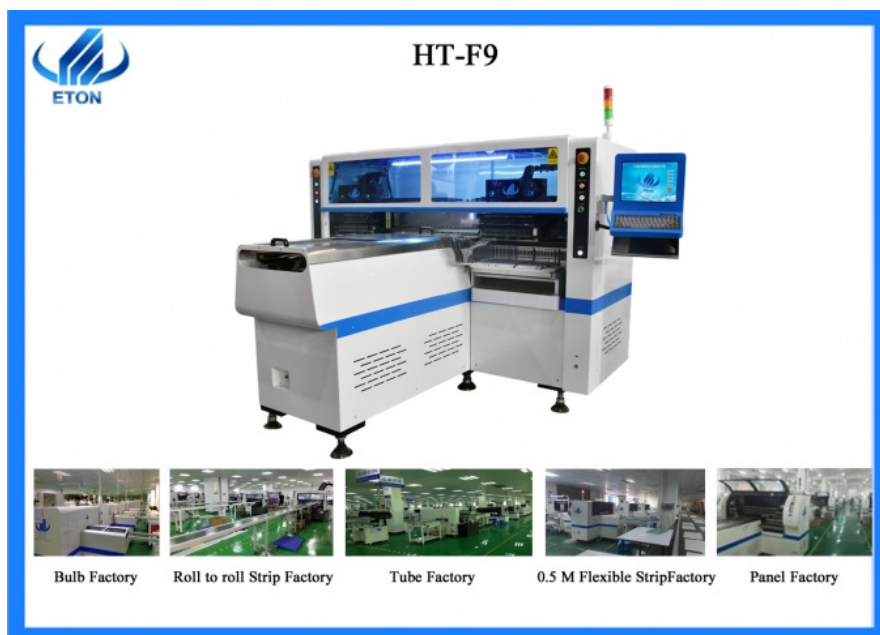
Technical parameter of pick and place machine ht-x9

HT-X9 is dual-arm magnetic levitation LED high speed pick and place machine.the capacity reach 200000CPH.It is Suitable for 0.5M,1M Strip, Tube and Panel Light.it can mount LED 3014/3020/3528/5050 and resistor,capacitors,bridge rectifiers,etc.