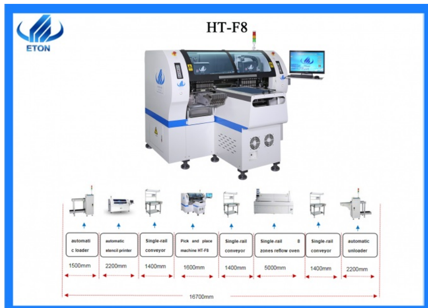
product features of smt mounter ht-f8