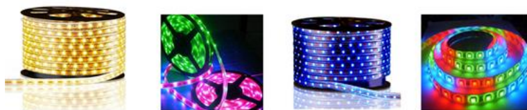
Multicolor led strip light,suitable for differernt length

HT-T9 SMT strip light making machine mainly using in SMT strip light production line. For picking led chip and then mount on the PCB. In actual production line, it is using in led lightings, professional for 5 meters, 15meters, 25meters, 50 meters.