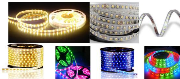
Multicolor led strip light,suitable for differernt length

T9 suitable for multicolor flexible strip light, as fellow picture show: