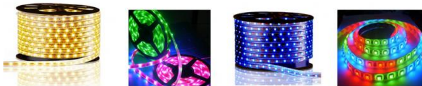
Multicolor led strip light,suitable for differernt length