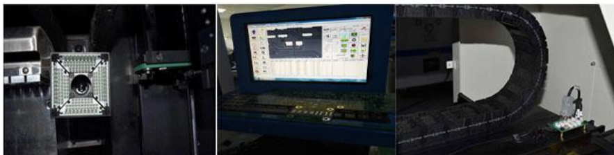
2 sets of imported camera Touch screen monitor Tanks chain