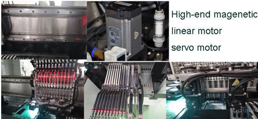
High-end magnetic linear motor servo motor

E8S is single module magnetic linear motor multifunctional pick and place machine, it has 28 PCS of feeders stations, 12 PCS of nozzles, the capacity reach 45000CPH, is very high speed, it has vision alignment flight identification, mark correction. The precision of mounting components is very high.