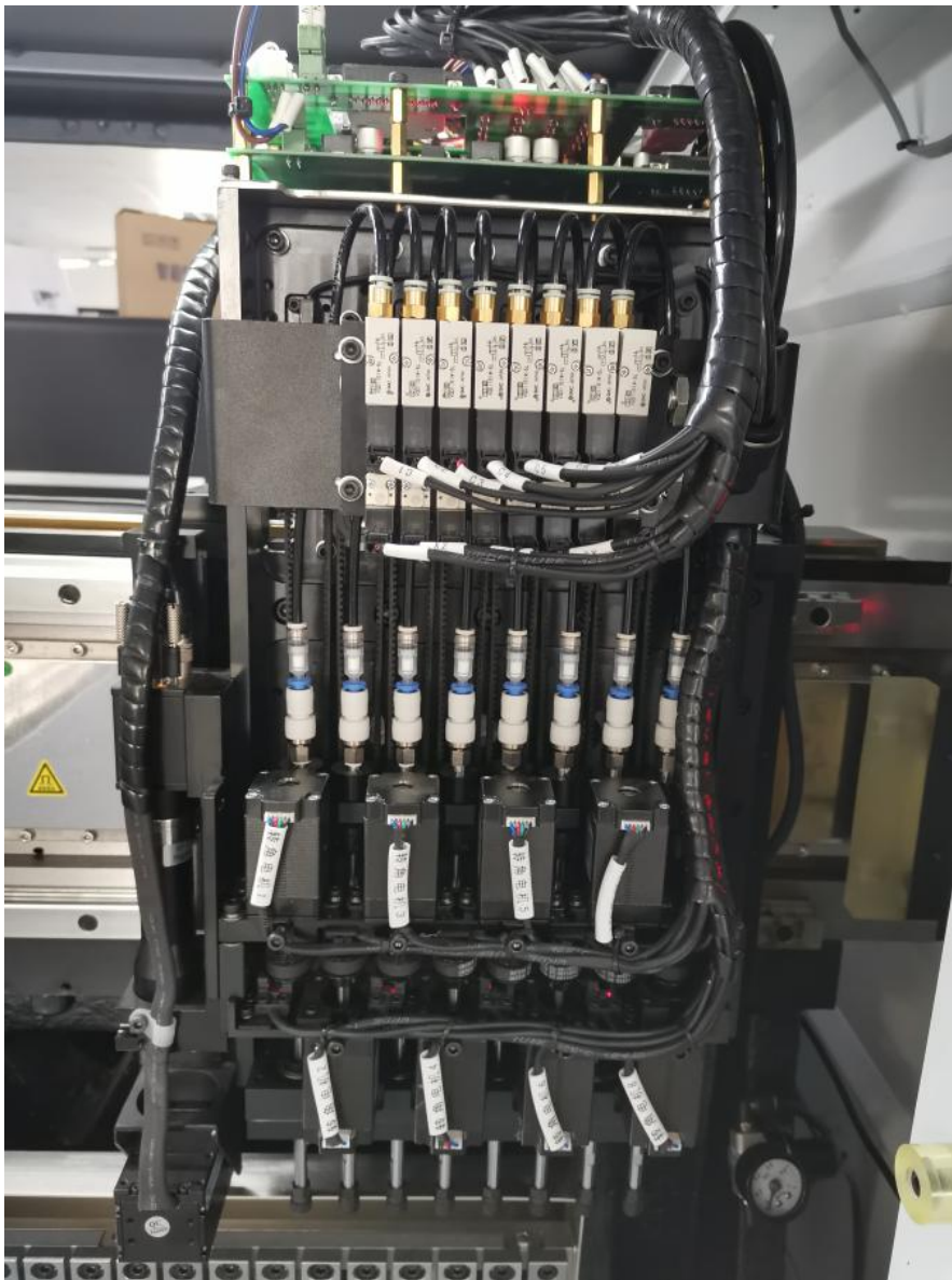
smt line led light production line layout