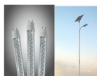
Tube Solar lamp