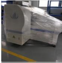
Step 1 Film packing