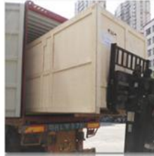
Step 3 Wooden box package

We pack the goods in vacuum wooden cases, which has the advantage of reducing the oxidation of the goods and ensuring their dryness.