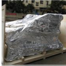
Step 2 Vacuum packing