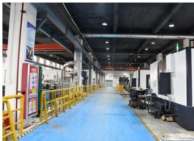
Sheet metal workshop