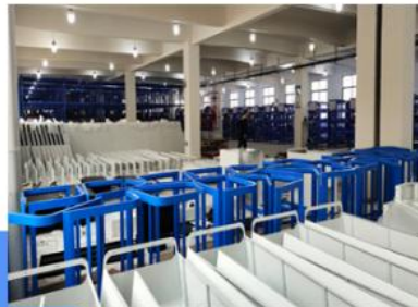
Rack placement library