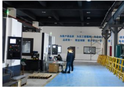
Sheet metal workshop