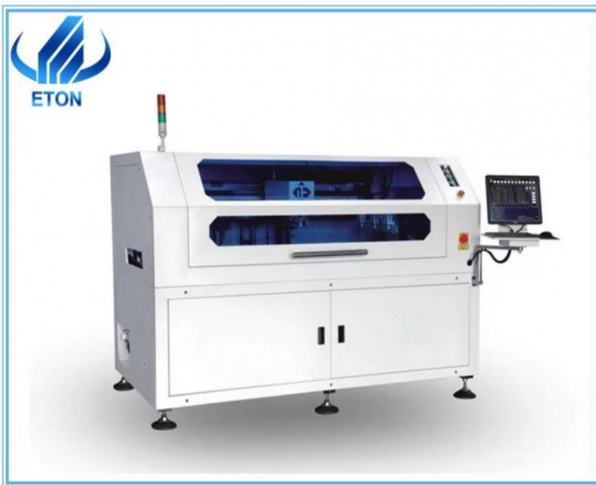
SMT production line layout