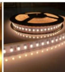
Flexible strip and Roll to Roll