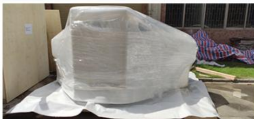
Step1: Wrap with stretch film to prevent the equipment from