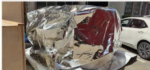
Step2: Vacuum paper packaging and moisture-proof bag, so that the machine can be kept dry during transportation to prevent moisture.