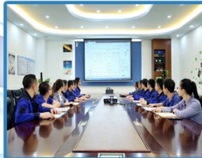
China Top brand, leading manufacturer of SMT machine.