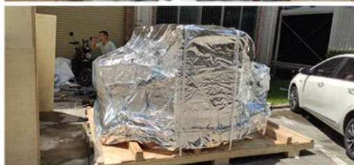
Step3: Use straps and triangular wood to fix the machine to prevent damage to the machine during transportation.