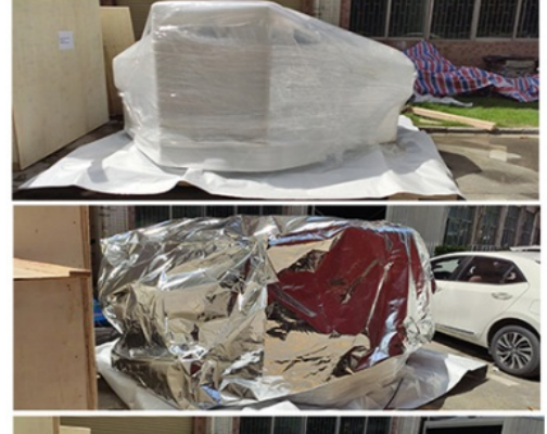
Step1: Wrap with stretch film to prevent the equipment from