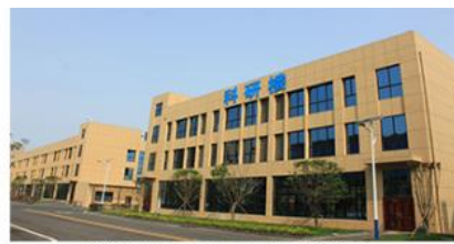
Scientific research building