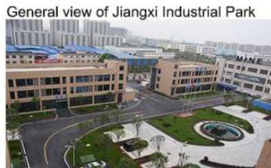
General view of Jiangxi Industrial Park