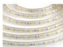
flexible light strip