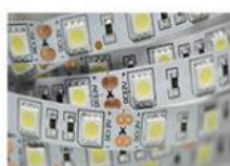
flexible light strip