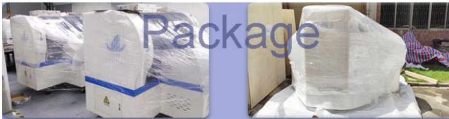
Step 1: Film packing and foam cotton prevent the dust and water to protect the machine