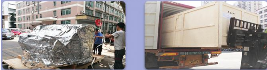
Step 2: Vacuum package and moisture proof bag, to keep dry of the machine during the transportation, then equip with sturdy wooden boxes and transported by trucks to specified port