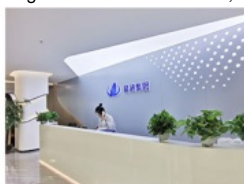
The hall of office building in shenzhen