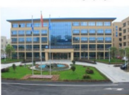
more than 300 employees