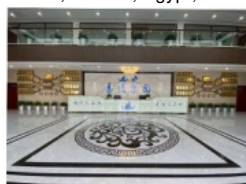
The hall of office building in jiangxi