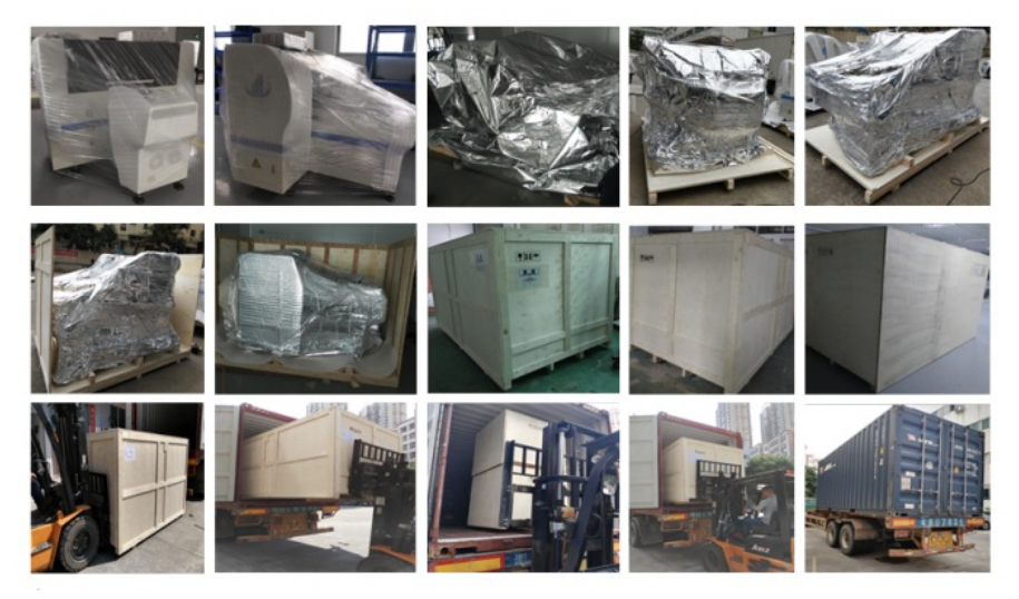
Step 1: Wrap with stretch film to prevent the equipment from.