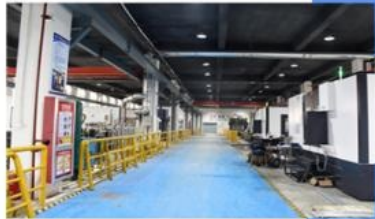
Sheet metal workshop