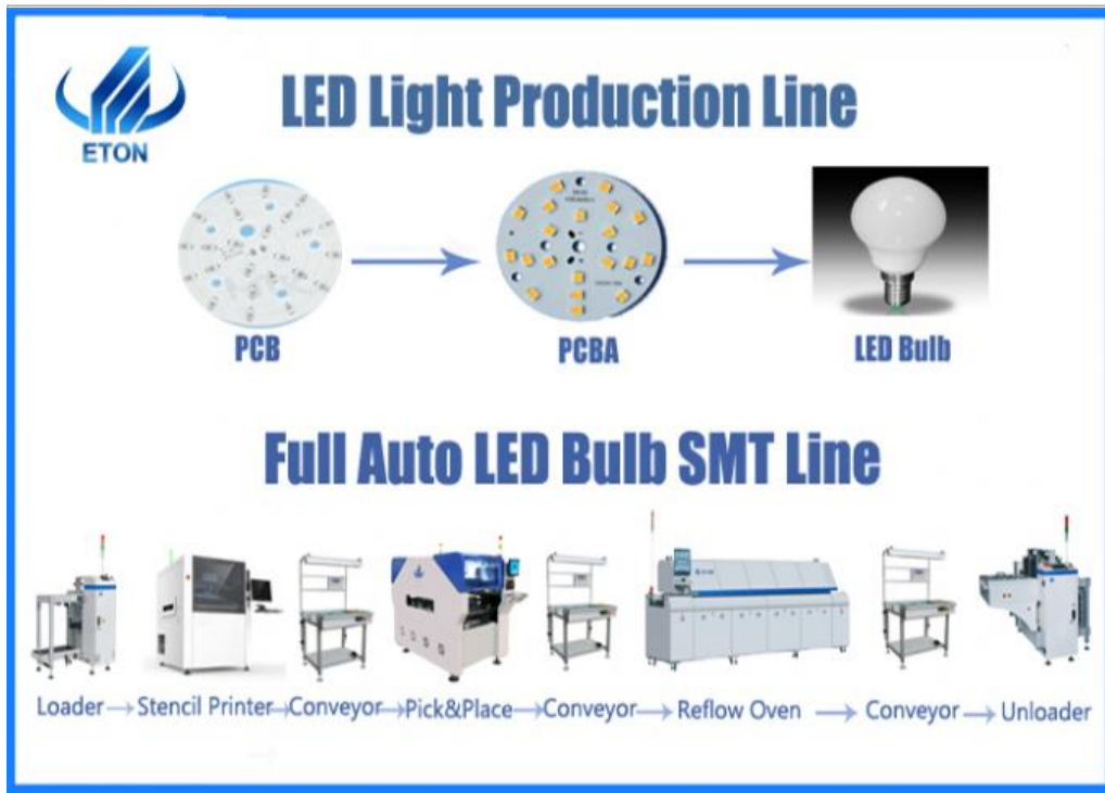
Application of SMT line