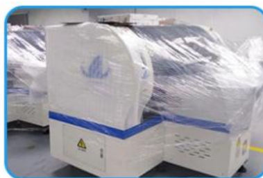
Step1: package with foam cotton