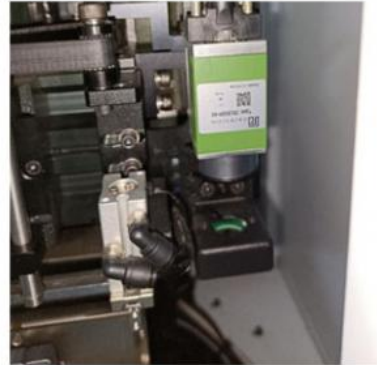
Feeder debug camera