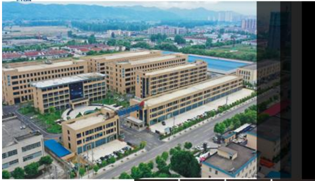
Jiangxi Intelligent Park