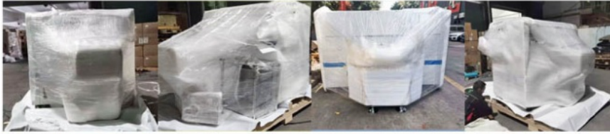
Step one: Pack the machine with foam cotton and stretch film to protect the outside of the machine