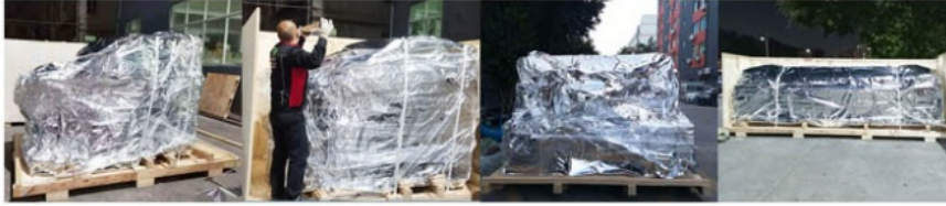
Step two: Vacuum packaging. Vacuum packaging; put the desiccant in a vacuum bag to prevent moisture; use straps to secure the machine;