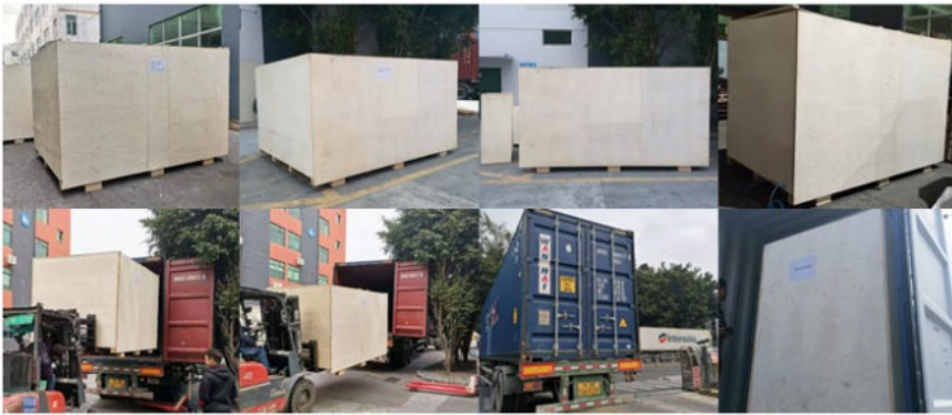
step three: professional wooden box packaging

All machines are packed with vacuum and wooden packing like the one in the pictures.