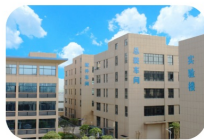
ETON has the full industry park for