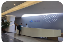
The hall of office building in Shenzhen