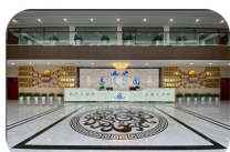
The hall of office building in Jiangxi