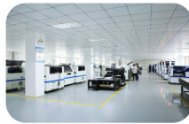
ETON Assemble workstation