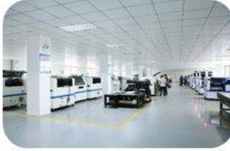
ETON Assemble workroom