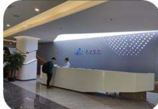
The hall of office building in Shenzhen