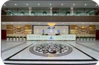
The hall of office building in Jiangxi

Our company was established in 2011 with over 10 years' experiences in high-speed pick and place machine. We are the largest high-tech manufacturer in China with strong capability of design, R&D, manufacture, sales & services. "High efficiency", "High quality" and "High Stability" are the core technology of ETON. We got 9 invention Patents, 112 practical patents, 12 software copyrights. Moreover, ETON has invented the fastest automatic pick and place machine with speed 250000CPH. We got large market share in USA, KOREA, INDIA, GERMANY, TURKEY more than 20 countries. We expanded our plant and built a new bigger industrial park in Jiangxi Province.