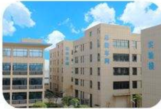
ETON has the full industry park for