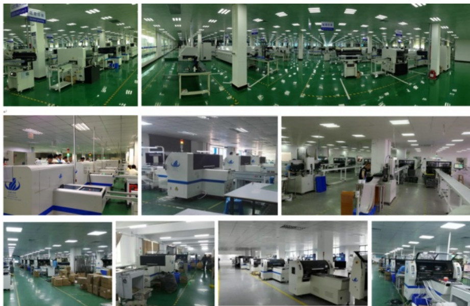
Company introduction, exhibition