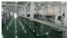
50 m Strip Factory