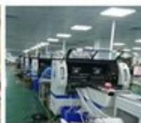
1 m Strip Factory