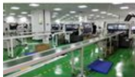
25 m Strip Factory