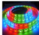
Multicolor led strip light,suitable for differernt length