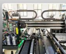
Double modules produce two different products at the same time