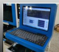
With two industrial computers independent control