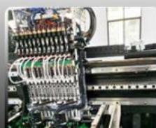
High precision high speed magnetic linear motor