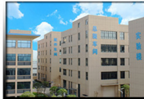
ETON industrail park