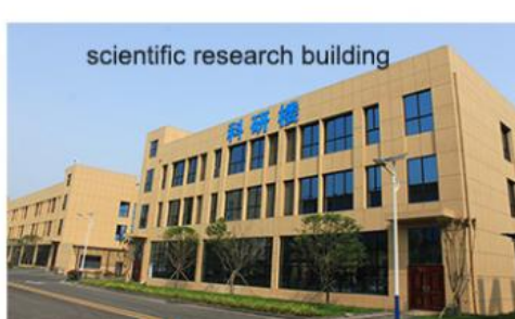
scientific research building