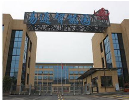
the park gate