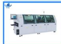
Wave soldering machine