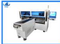
5 m/100m Roll to Roll