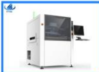
Automatic stencil printer