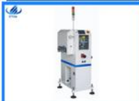
PCB cleaning machine