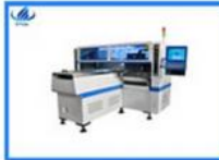
Super speed 25000CPH