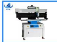
Semi-auto stencil printer