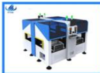
High-end 4 modules 40 Heads