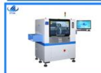
Glue dispensing machine