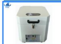
Solder paste mixer