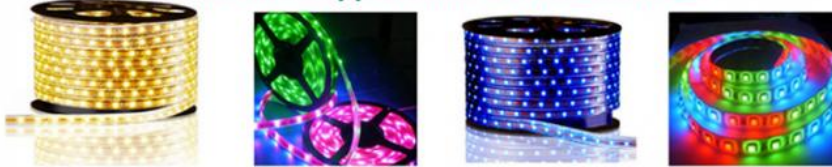
Multicolor led strip light, suitable for different length