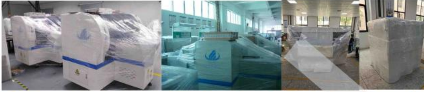
Step one: packing the machine with foam cotton and stretch film to protect the outside of the machine