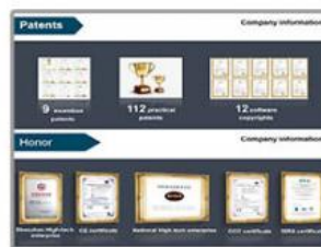
133 patent certificates