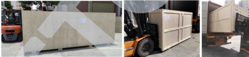
Step three: professional wooden box packaging