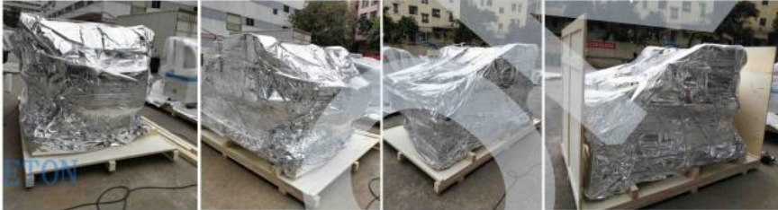
Step two: Vacuum packaging; put the desiccant in a vacuum bag to prevent moisture; use straps to secure the machine