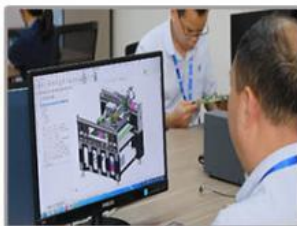
Excellent R&D Team