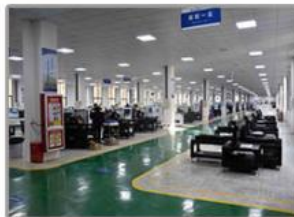
Pick and Place Machine Assembly Workshop