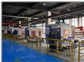
CNC Workshop Powder Spraying Polishing