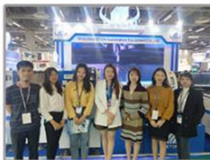
Professional Sale Team