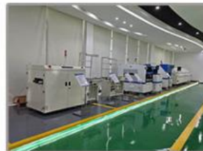
Full SMT Line Solution Showroom