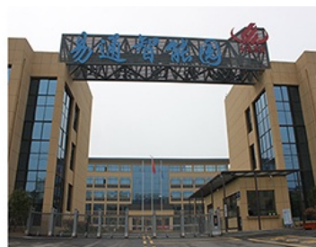
the park gate