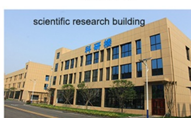
scientific research building