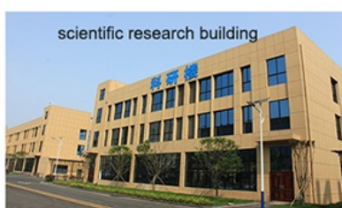
scientific research building