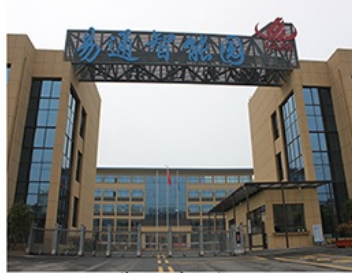
the park gate