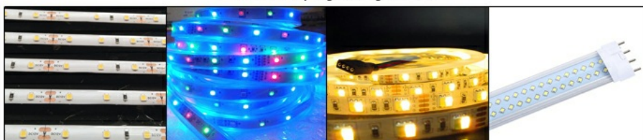
Flexible strip light, RGB, LED Tube