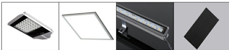
Street light, panel light, linear light, display

It is suitable for mounting 0.5m, 1m, 1.2m hard light board or soft light strip, and can produce linear products such as lamp tube, panel light, display screen and so on.