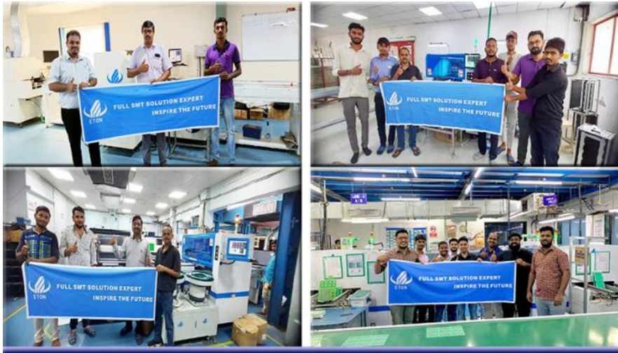
Customer group photo and customer factory

Egypt, Turkey, Russia, Brazil etc. And here are some of our big customers: SURYA, POLYCAB, FIEM, RK, GK, TECHNO LED, CALCOM, ACK, KENDAL, RangDong, UNISTAR, and so on.