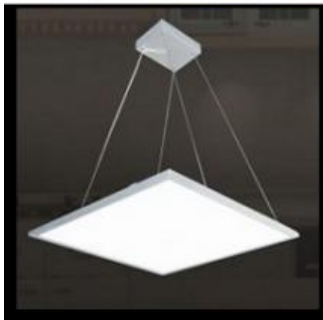
LED panel light