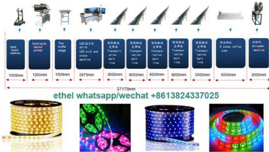
Multicolor led strip light, suitable for different length