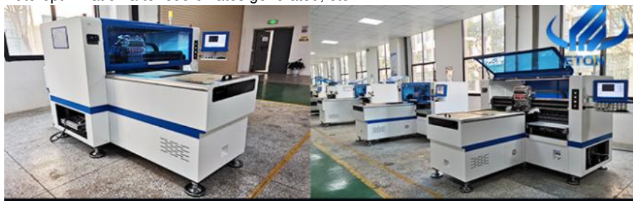
HT-E8S-1200 Optimal capacity: 45000 CPH PCB size: 1200*500 mm

Auto-optimization after coordinates generated, etc.