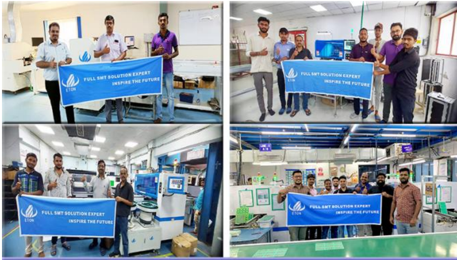
Customer group photo and customer factory