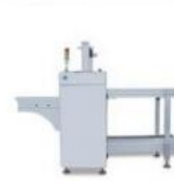
Full automatic unloader