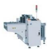
NG/OK Double rail unloader