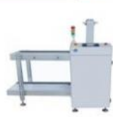
Full automatic loader