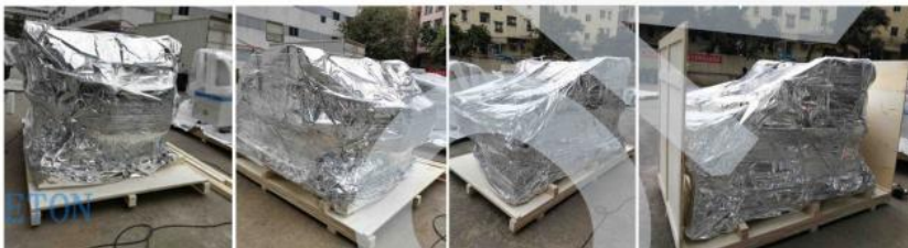
Step two: Vacuum packaging: put the desiccant in a vacuum bag to prevent moisture; use straps to secure the machine