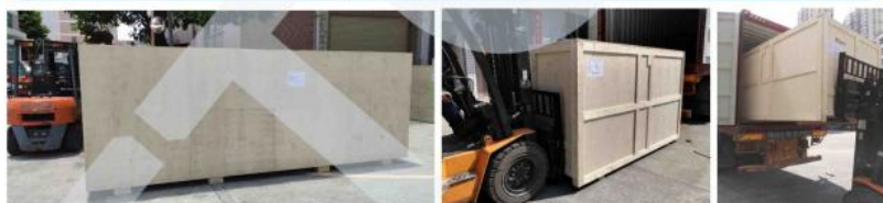
Step three: professional wooden box packaging