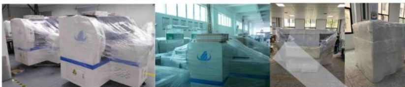
Step one: packing the machine with foam cotton and stretch film to protect the outside of the machine